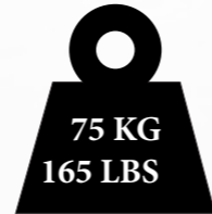
Total Packed Weight

Vancore Nederland b.v. Tolhuswei 7a - 9 8501 ZP JOURE - The Netherlands Tel: +31 513 415127 Fax: +31 513 413038 Email: info@vancore.nl