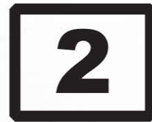
Total number of boxes