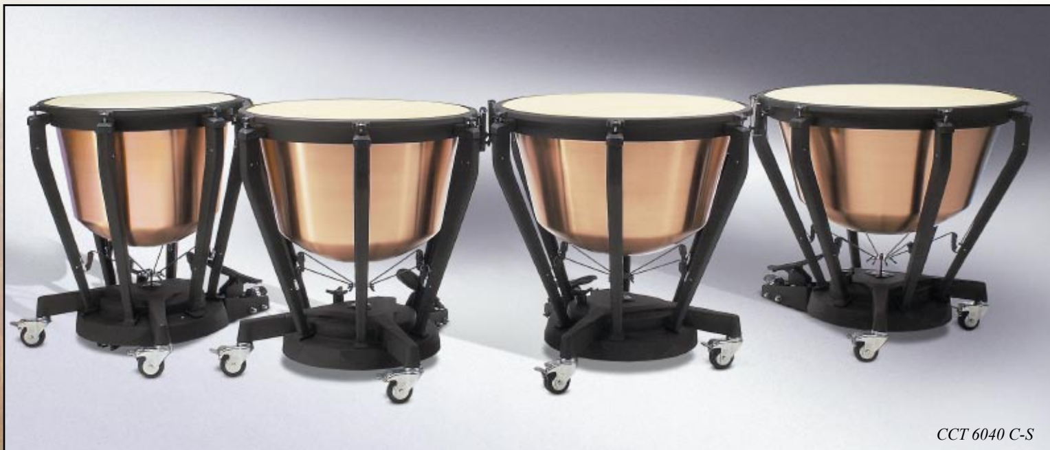
CCT 6040 C-S

Many years of research have resulted in the development of the Custom Classic Timpani. These timpani have been developed in close cooperation with prominent professional timpanists, who were unsatisfied with the existing timpani and tuning systems. Vancore designers and engineers have spent countless hours working with and listening to demanding professionals. The result is a world-class instrument which will be the envy of every discriminating timpanist.