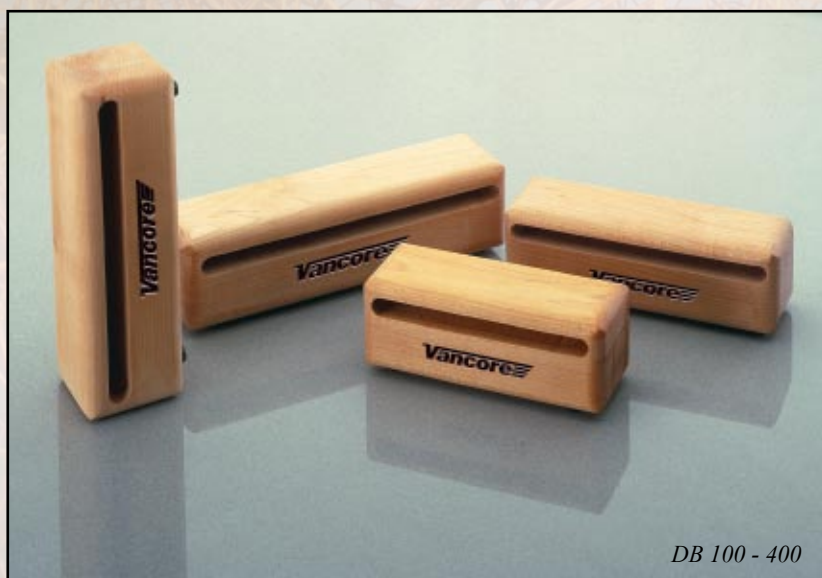
DB 100 - 400