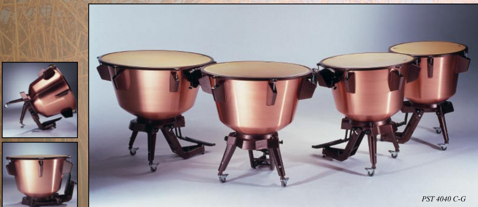
PST 4040 C-G

The Vancore Performing Standard Series timpani are specially for ease of transport. Though light in weight, these fine instruments have an unusual big, full sound. For timpanists on the go, these are the instruments of choice!