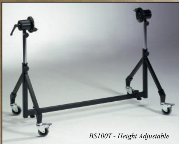
BS100T - Height Adjustable