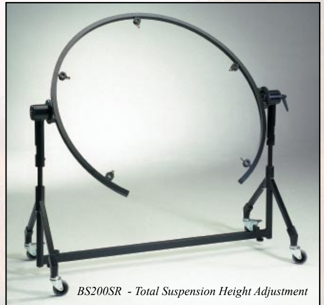
BS200SR - Total Suspension Height Adjustment